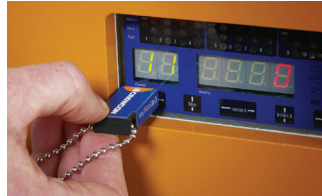
Non-intrusive operation on Vortex FP models