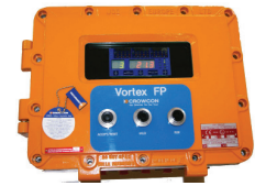
Vortex FP Compact