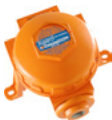
Industry-standard gas detectors