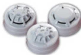
Up to 20 fire/heat detectors per zone