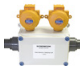
Fan control for Crowcon's Environmental Sampling Unit

Crowcon reserves the right to change the design or specification of the product without notice. Check www.crowcon.com for updates.