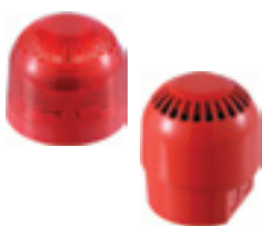
Sounders and Beacons Safe area, intrinsically safe or flameproof options